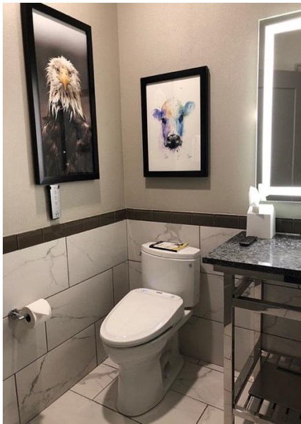
The high-end Current Iowa hotel features WASHLET in every room and suite.