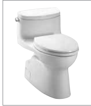
MS644114CEF(G) Carolina® II One-Piece High-Efficiency Toilet