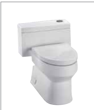
MS984244CFG Ryohan® One-Piece Toilet