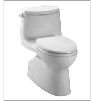
MS614114CEF(G) Carlyle® II One-Piece High-Efficiency Toilet