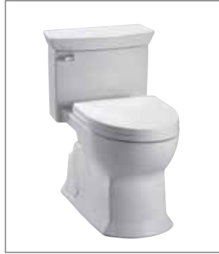
MS964214CEF(G) Eco Soirée® One-Piece High-Efficiency Toilet