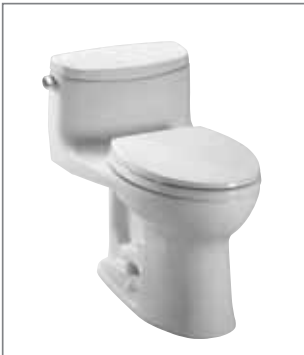
MS634114CEF(G) Supreme® II One-Piece High-Efficiency Toilet