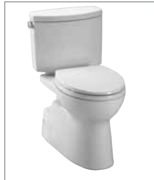
CST474CEF(G) Vespin® II Close Coupled High-Efficiency Toilet