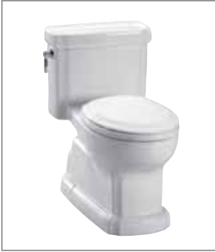
MS974224CEF(G) Eco Guinevere® One-Piece High-Efficiency Toilet