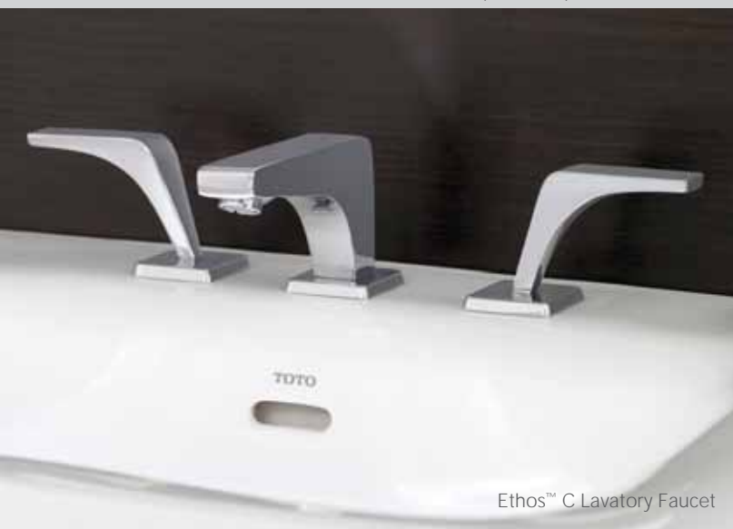
Ethos™ C Lavatory Faucet

*Check www.totousa.com for the various product specification sheets for Ethos