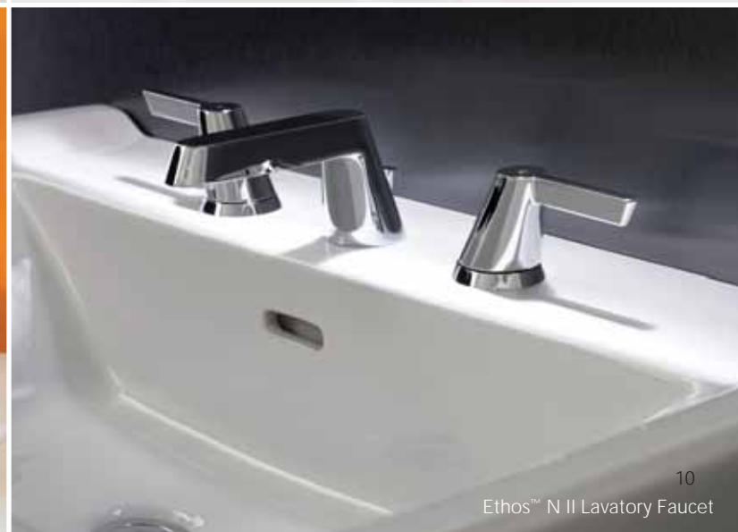
Ethos™ N II Lavatory Faucet