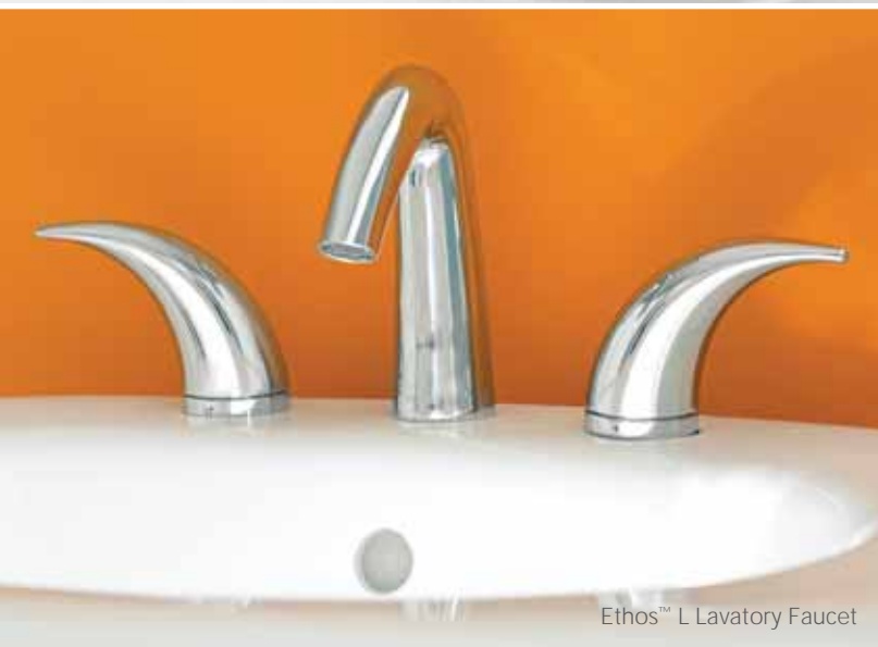
Ethos™ L Lavatory Faucet