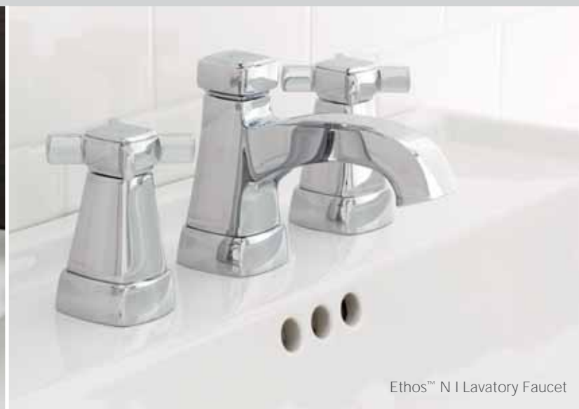
Ethos™ N I Lavatory Faucet