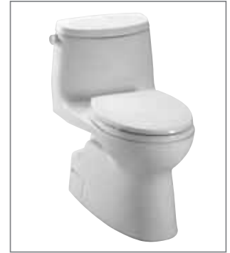
MS614114CEF(G) Carlyle® II One-Piece High-Efficiency Toilet