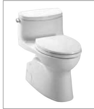
MS644114CEF(G) Carolina® II One-Piece High-Efficiency Toilet