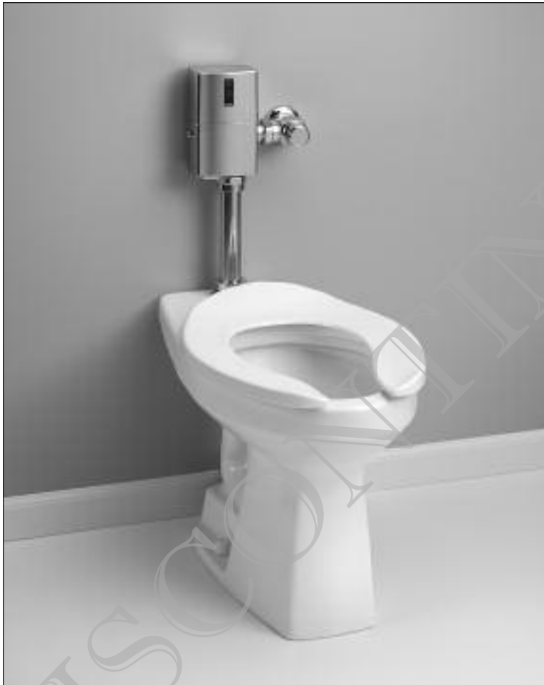
CT 705EL - Eco Flushometer Toilet - ADA Compliant SC534 - Commercial Toilet Seat TET1LN32#CP - 1.28GPF ECO EFV - Automatic Flushometer Valve