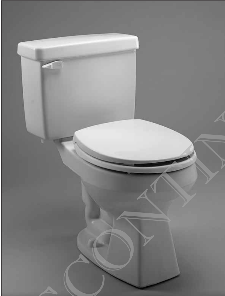
CST 703 - 1.6 Gpf Toilet SS113 - SoftClose Toilet Seat