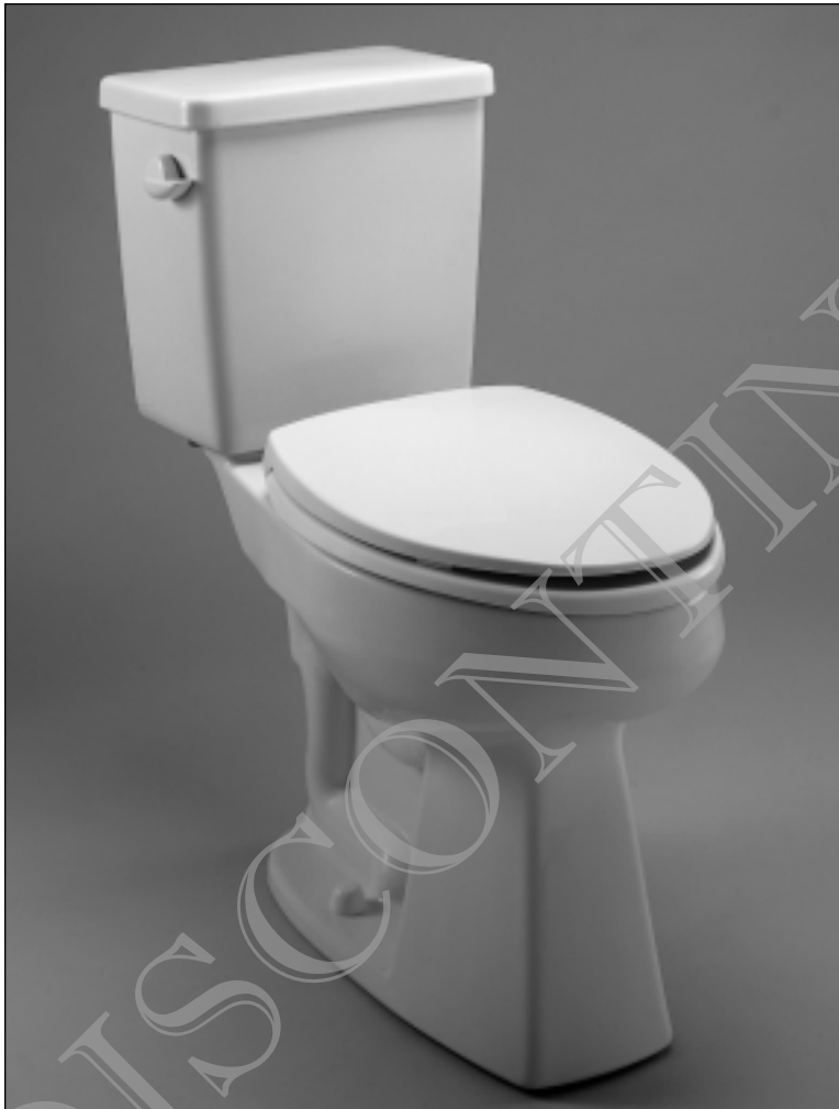
CST704L.14 - 1.6 GPF Toilet SS114 - SoftClose Toilet Seat