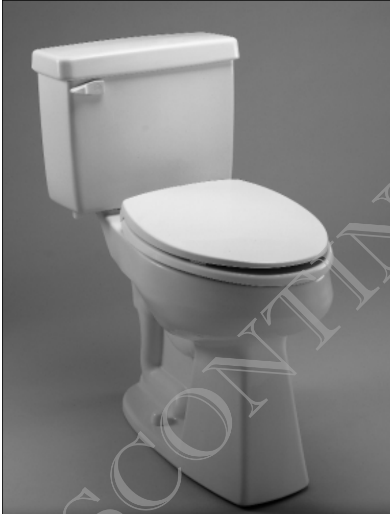
CST704L - 1.6 Gpf Toilet SS114 - SoftClose Toilet Seat

Colors: Standard #01 Cotton Optional See price book for additional colors