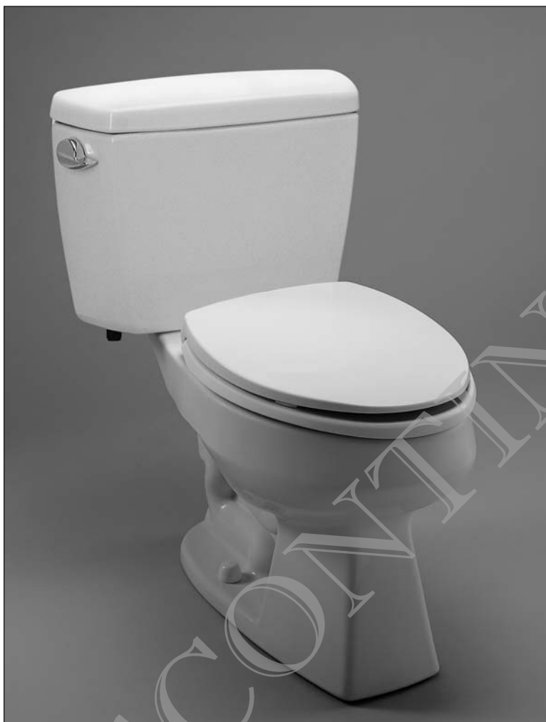
CST 704X.10 - 1.6 Gpf Toilet SS114 - SoftClose Toilet Seat