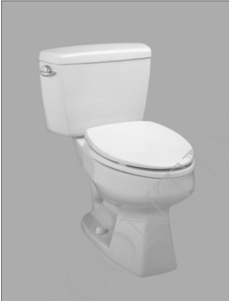
CST714 - Carusoe Toilet SS114 - SoftClose Seat