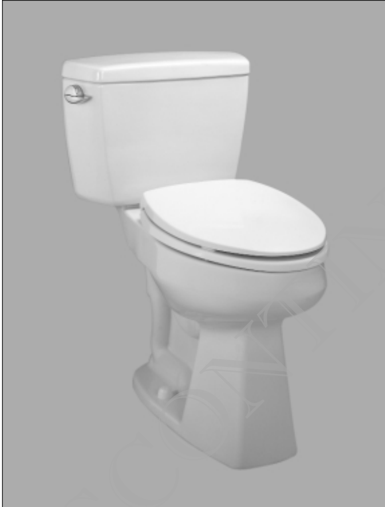
CST714L - Carusoe Toilet ADA SS114 - SoftClose Seat