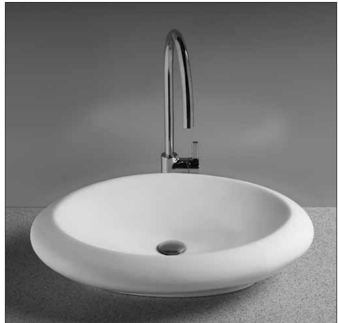
Shown here with Po faucet TL380SD#CP