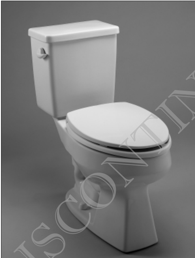
CST704.14 - 1.6 Gpf Toilet SS114 - SoftClose Toilet Seat