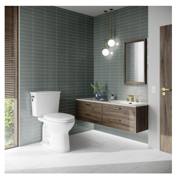
TOTO's new Drake Transitional Toilet has an elegant, streamlined design. Its tank flares gently as it rises to support a generous lid with a distinctive lip that has been modeled into a shelf.

With their long-view global design aesthetic and clean, simple lines, TOTO's new Drake and Drake Transitional two-piece toilets will grace any bathroom environment for years to come.