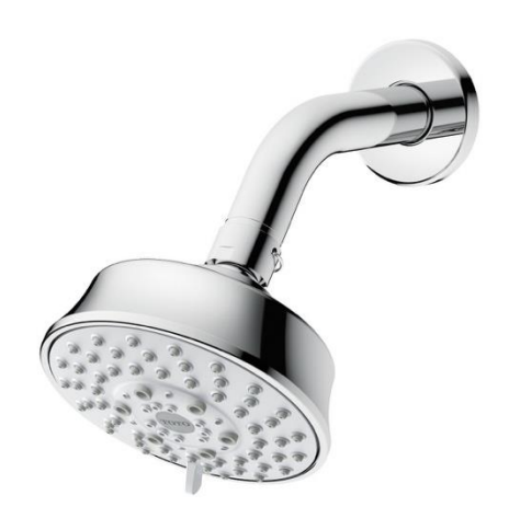
TOTO's new classic design overhead shower offers five spray patterns.

TOTO introduces a showering experience as relaxing as a soaking in warm bath. This is the power of the Warm Spa. A single voluminous pillar of warm water flows silently from TOTO's overhead rainshower or handshower, enveloping the body's curves in relaxing warmth, without heat loss or splash. With Warm Spa, TOTO presents a completely new showering experience that warms the body thoroughly without wasting water.