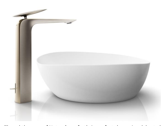
The subtle grace of Nature's perfectly imperfect shapes is celebrated in the ZA Vessel Faucet and Kiwami Asymmetrical Vessel Lavatory, which offer a chic, high-design twist on these natural shapes for a timeless design.

(Morrow, GA) January 21, 2020 — This year, TOTO dramatically increases its North American faucet portfolio by introducing six new families – ZA, GF, GB, GE, GC and GM. Designers and design-savvy homeowners will delight in these new statement-making faucets, which will convey a sophisticated sense of style to any bath space. They will also enjoy additional features that go far beyond the faucets' refined aesthetic appeal.