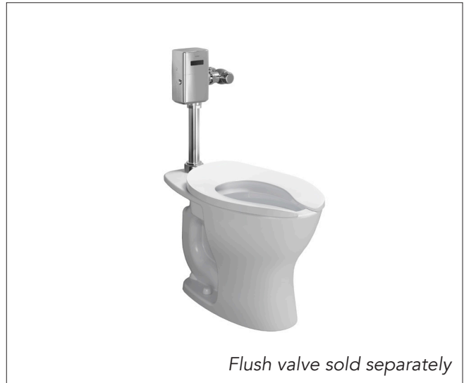
Flush valve sold separately