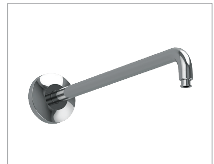
TBW07025U: Rain Shower Arm Wall-Mount, 16"

Please note the following components are sold separately