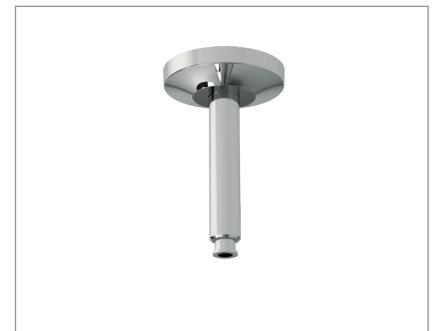
TS110MC6: Rain Shower Arm Ceiling Mount 6"